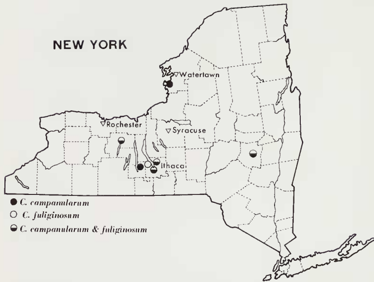
Figure 1. Distribution of Chelostoma in New York State.

following modification of Mitchell's (1962, p. 5) key to genera of eastern United States Megachilidae: